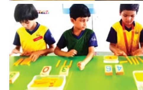
Language Arts Lab